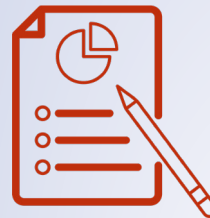
Cost & Budget Optimization