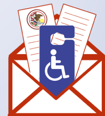
Customized Mailing Message