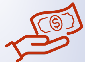
Pay As You Go