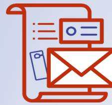
Unique to Customer Plan