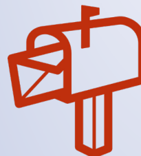
Direct to User Distribution