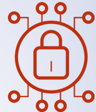
Secure Data Management