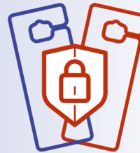
Secure Asset Storage & Management