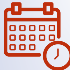
Less Lead Time