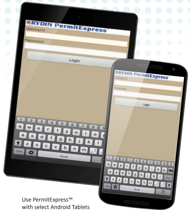
Use PermitExpress™ with select Android Tablets and Smartphones.

Make the process more efficient. Convenient online options allow offenders to pay or appeal at any time of day. Offering easy payment options can help boost collection rates.